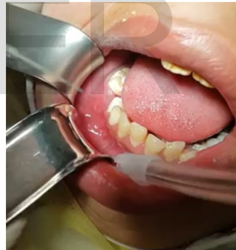
(Fig1) Clinical photo shows a swelling extending

excised specimen was sent for routine histopathological examination. On microscopic examination the lesion was diagnosed as dentigerous cyst (Fig 6). Radiographs were made at follow up intervals of 4 month interval (Fig 7) and at the end of one year (Fig 8). The one year post operative radiograph showed the healed surgical margins following enucleation of the margins.