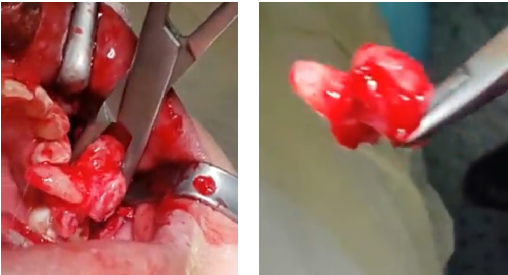
(Fig 5A & 5B)